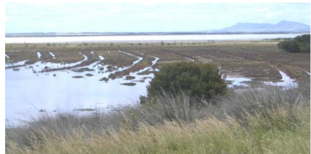
The site was located in a regional groundwater discharge zone (note the salt lake in the background) and subject to seasonal inundation.