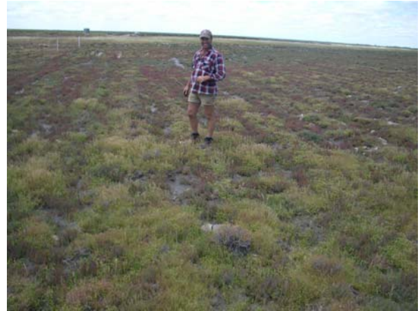
Puccinellia boosts production on previously low value ground. Applying fertiliser would boost production further.