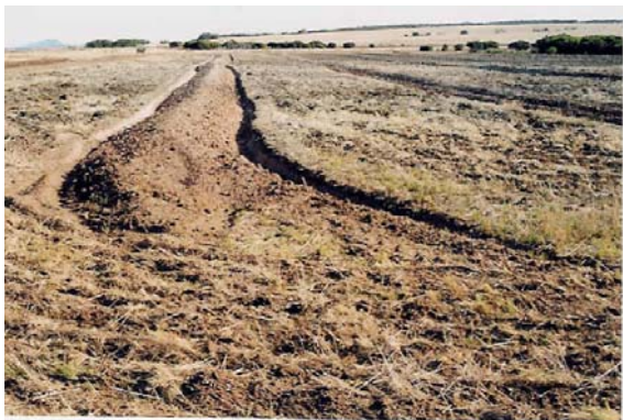
Formed mounds, prior to saltbush establishment. The areas between rows were sown to puccinellia.