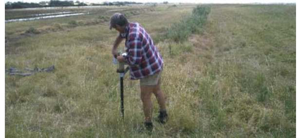
Saltbush doesn't like waterlogging. Despite planting on mounds, productivity declined towards the lower-lying, wetter area.