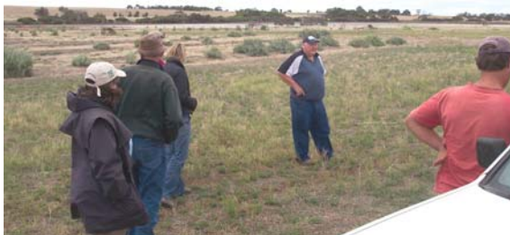
Rises (in foreground) were sown to lucerne and balansa clover. In the background, rows of old man saltbush and flats sown to puccinellia offer productive options for saline ground. (Photo taken: March 2006)