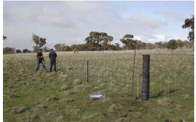
Fencing the tall wheat grass trial site.