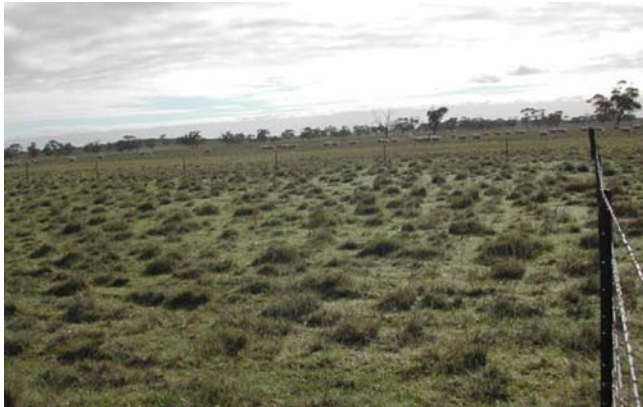
Tall wheat grass pastures (Aug 2003).