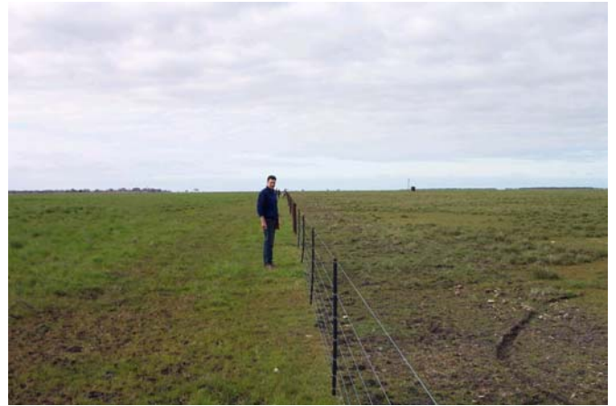
This photograph shows the urea treated (left) and the untreated (right) paddocks of the Ashmore trial site. The N treated pasture (left) has increased growth, more consistent ground cover, and visually it looks greener.