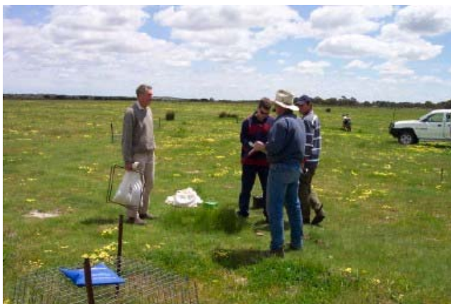
Group members discussing results during the pasture cut day.