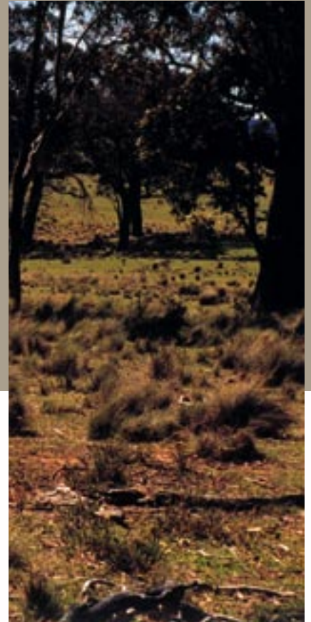
Grassy woodlands on the southern tablelands of NSW provide production and environmental benefits.