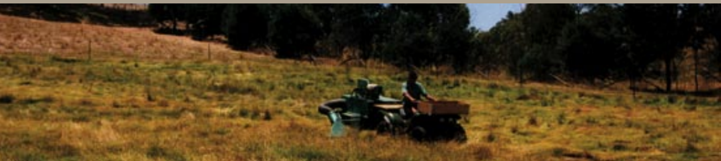
Native pastures providing an alternative on-farm income. Seed harvesting Microlaena , Southern Tablelands NSW.

Traditionally most of these pasture systems have been run as low input, low output grazing operations. However opportunities exist to lift the productive capacity of these pastures through better management while sustaining the diversity of native species in these systems.