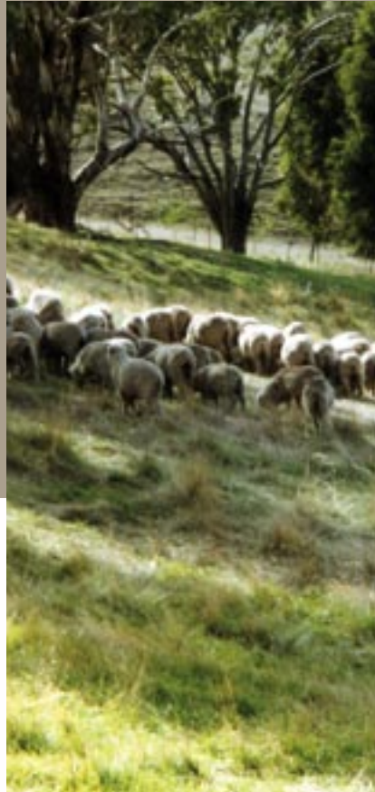
Sheep grazing native pastures, Southern Tablelands, NSW.