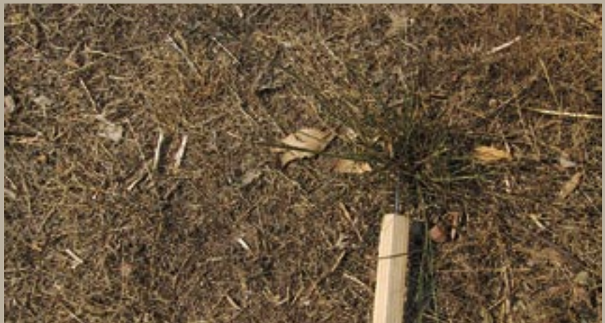
Monitor pasture composition by recording the species directly under the nail head from 50+ randomly chosen sites in a paddock.

Because of the complexity and variation in native pasture systems, it is difficult to predict the outcome of management changes on pasture composition and productivity. It can also be difficult to separate seasonal effects from treatment effects. For this reason, a similar paddock run under current management should be used as a comparison with the paddock receiving the changed regime.