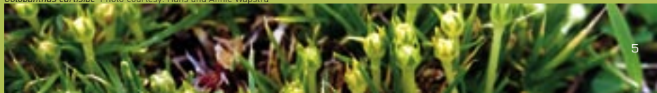
Colobanthus curtisiae

“A number of the world's biggest retailers of woollen garments are showing increased interest in using wool that is produced with minimal impact on the natural environment.”