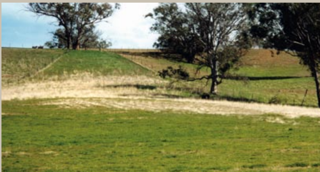
Native Grasslands on the Southern Tablelands, NSW.

Any change in practice will alter the balance of species in the sward. Evaluation of the impact of changed management practices will ensure long term productivity of the pasture is enhanced and maintained (refer to page 8, Monitoring ).