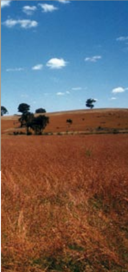
Native grasslands near Yass, NSW. This paddock is harvested for a native seed business.