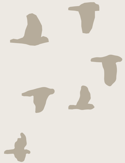
Table 1: Ratings for bird species on your farm

Using Table 1, put the relevant rating for each component in the far right column of Table 2 and total to give an overall score. Use the following totals to rate your remnant vegetation and identify some of the potential reasons for the number of birds observed.